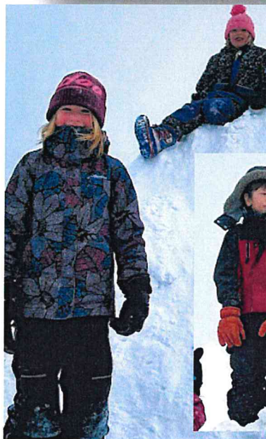
Grade one playing on the snow hill!