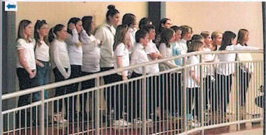
Our CPrep Kiddos spreading kindness with treats for the EHS staff