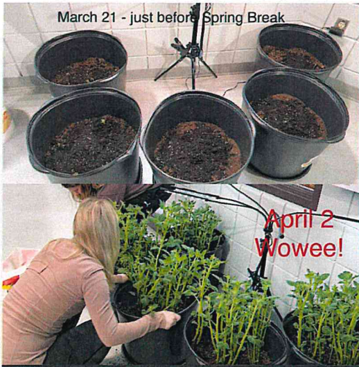
Spuds in a Tubs are growing strong!