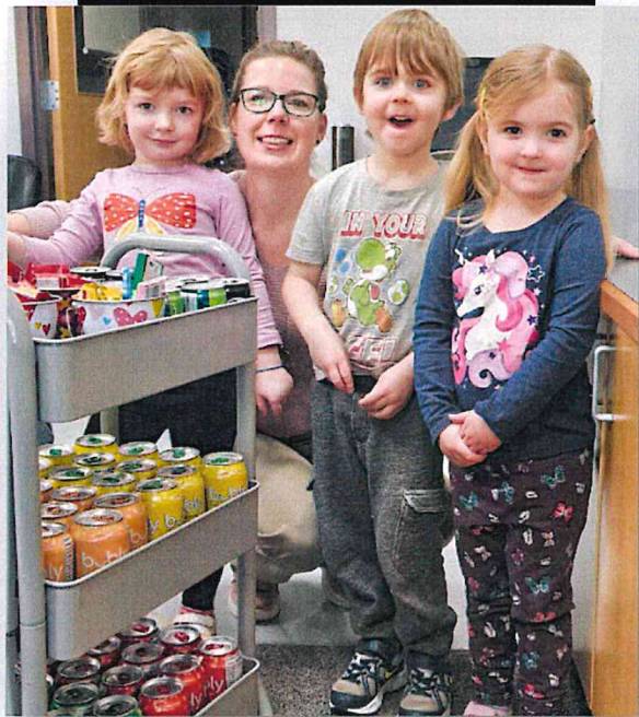
Our CPrep Kiddos spreading kindness with treats for the EHS staff